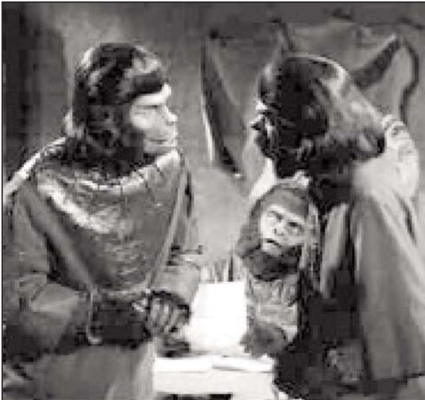
With Roddy McDowall "A true professional and a real joy to be with"