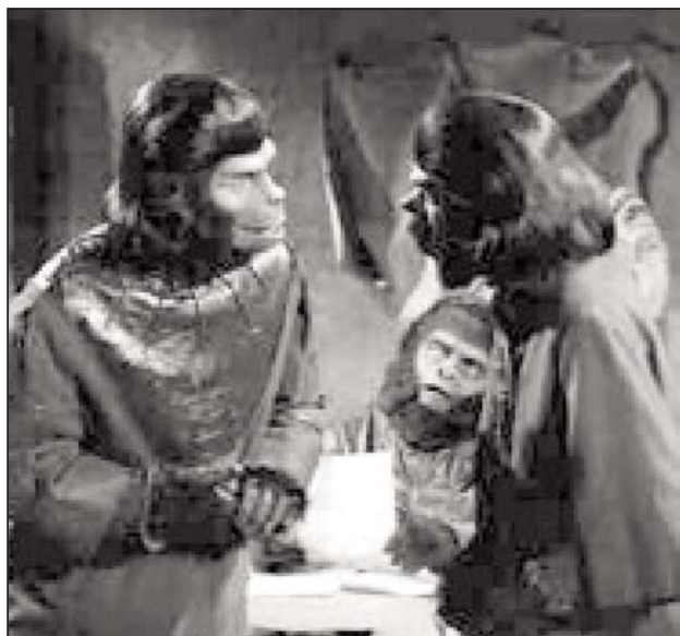
With Roddy McDowall "A true professional and a real joy to be with"