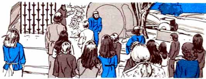
Veska speaks to a crowd of humans about two strangers who are insane. He tells them not to believe the stories that these people tell.