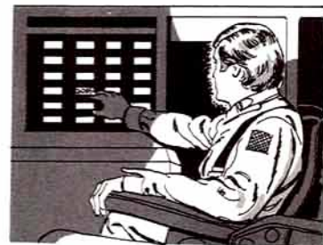
The space ship chronometer read 3085 A.D..

Virdon and Burke concluded they must have gone through a time warp. Anxiously they awaited morning, planning to check the ship's chronometer.