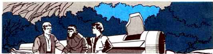
They comforted each other for the long adventure that lay ahead. "Which way, Galen?" Virdon asked. "It's your world." "Now it is yours too," Galen answered.

The astronauts and their new chimp friend, Galen, zigzagged through the woods with the flight control disc, hoping to find a way back through the time warp, somehow.